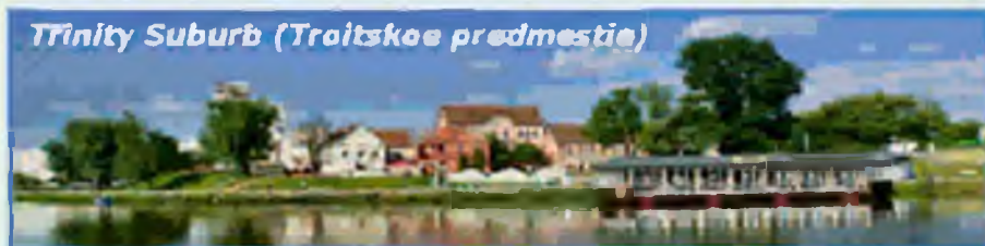
Trinity Suburb (Troitskoe predmestie)