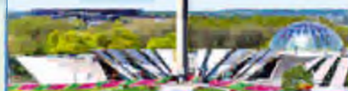
The Belarusian State Museum of the Great Patriotic War

It has been planned to open the Museum on Independence Day of the Republic of Belarus, on the 3rd of July, 2014. This occasion will dedicate the 70th anniversary of the liberation of Minsk from the German-fascist invaders.