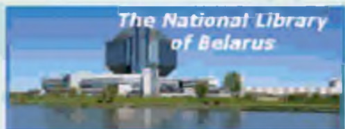
The National Library of Belarus

The new building will represent about 140 thousand of War Relics. Many of them are absolutely unique and have no analogues in the world museums of war.